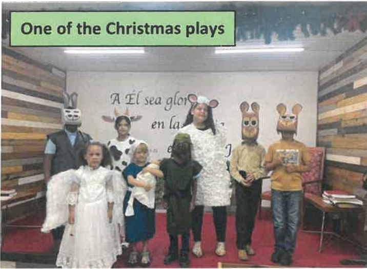
One of the Christmas plays